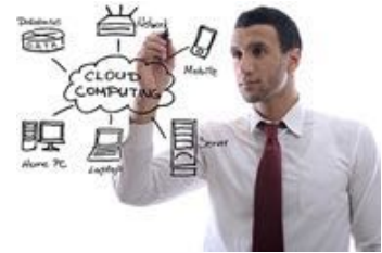
Database Administrators at work.

curious about new technology and adaptable. Employers look for people who can learn new systems quickly and start putting them to use right away.